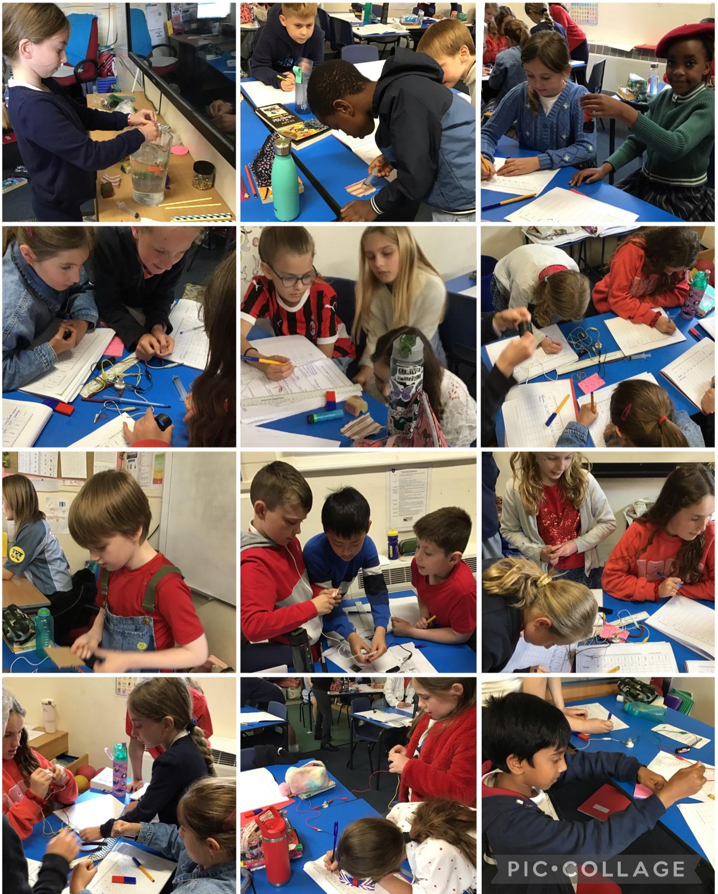
Science investigation - testing materials