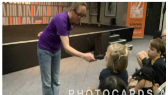
Meeting Maz Evans - Best selling author of 'Who Let the Gods Out'