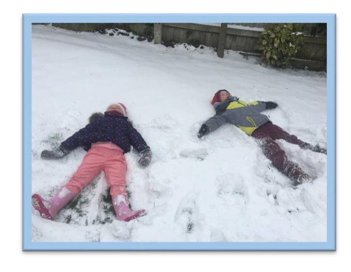
Stratford upon Avon Primary School