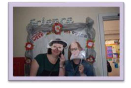
Stratford upon Avon Primary School