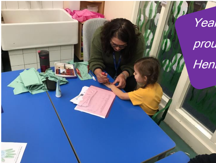
Year One are proud of their Henna tattoos