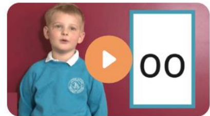
Phase 3 sounds taught in Reception Spring 1