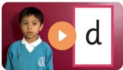
Phase 2 sounds taught in Reception Autumn 1

Thank you to all the parents who attended the Phonics workshop this week!