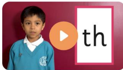
Phase 2 sounds taught in Reception Autumn 2