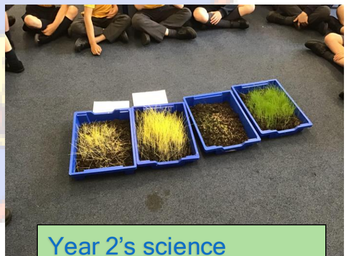
Year 2's science experiment - what environment does grass need to grow?