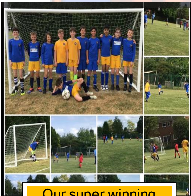
Our super winning boys football team