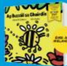
Blucy's Little Book £1.50 (includes token) £1.50 (includes token) (ages 4-6)