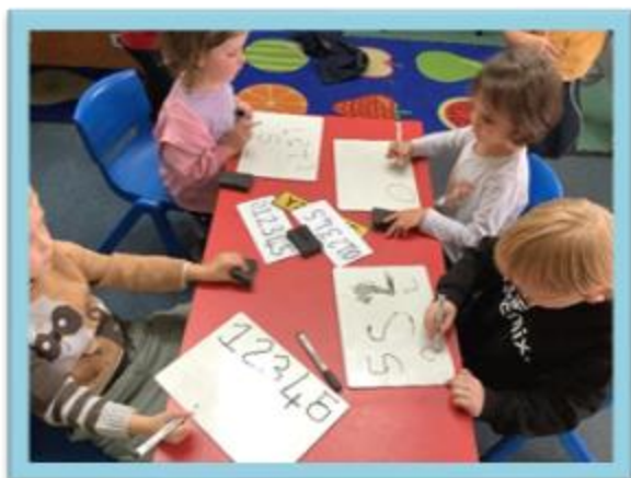
Stratford upon Avon Primary School

Children should only be kept at home if they have a serious illness or injury. If this is the case, parents should contact the school first thing. If a child has a minor illness e.g. mild headache, stomach aches etc. parents should inform the school and bring them in. If they don't get any better, school will contact parents straight away to collect them. If pupils have a dental, clinic or hospital appointment, parents should let the school know. Pupils should be brought back to school after appointments. Pupils should miss as little time as possible and we respectfully request that where possible appointments are made outside of school times.