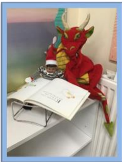
Stratford upon Avon Primary School

Finally, our very active Friends of Stratford Primary School (FOSP) group are an incredible support to our school in terms of the money they raise and the practical help they give. Over the years they have supported many activities and funded a number of significant projects. Every parent/carer is automatically a member of this group who hold some super family events throughout the year and we would urge our parents to get involved.