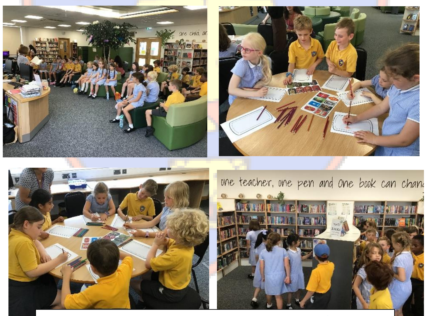
There is more treasure in books than in all the pirate's loot on Treasure Island – Walt Disney

On Wednesday, Year 3 visited the library at Stratford Girls' Grammar School for an engaging reading session led by sixth form students. The sixth formers, who regularly visit Stratford Primary every Wednesday to read with the children, orchestrated a series of activities designed to spark a deeper interest in reading. The session began with an interactive storytelling exercise centred on the legend of Romulus and Remus. The children were tasked with sequencing the events of the story, enhancing their comprehension and narrative skills. Following this, they channelled their creativity into designing Roman shields, linking the mythological tale to historical artefacts. The session concluded with a whimsical story about a curious creature from space that transformed into a cat upon arriving on Earth, captivating the children's imaginations. The children thoroughly enjoyed the session, which successfully combined historical education with creative expression, fostering enthusiasm for reading and storytelling.